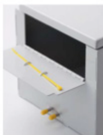
Figure 2: Bottom closure