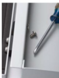
Figure 3: Switchable hinge opening

For a quotation, contact Intersect at solutions@intersectinc.com .