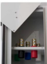
Figure 1: Deadfront protective cover